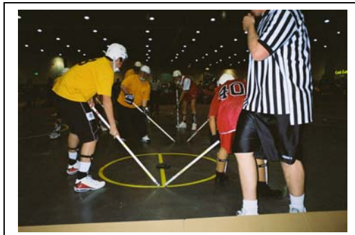
San Diego Championships – Gold Medal Santa Maria Team (yellow)

Floor Hockey is a fast paced exciting sport that develops your hand-eye coordination and aerobic activity. It's a great post-fall and pre-winter sport! (See Insert)